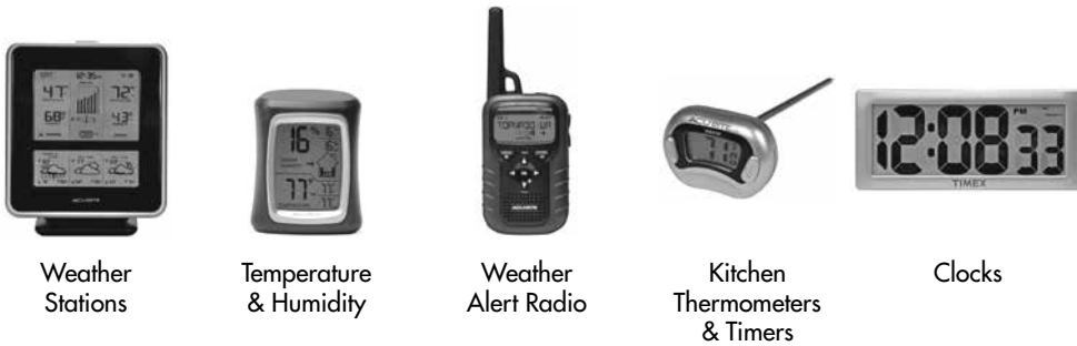
Weather Stations Temperature & Humidity Weather Alert Radio Kitchen Thermometers & Timers Clocks